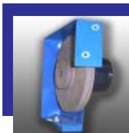
Model 4965 Permanent Magnet Tensioning Device