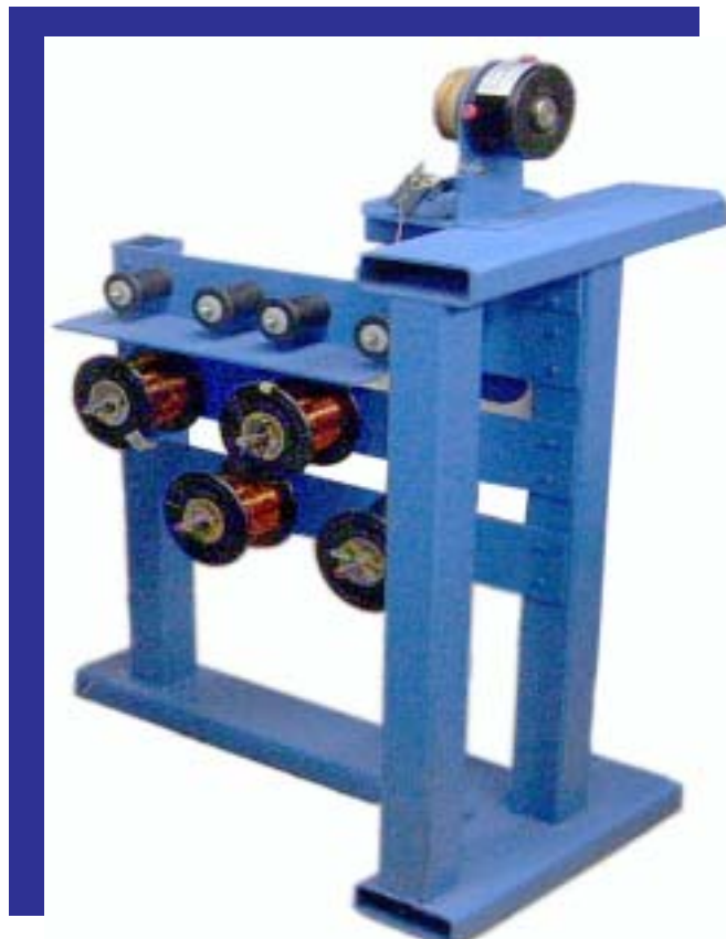
Model 43 illustrated with optional Model 4965 Permanent Magnet Tensioning Device

Model 43 can be used with many types of tensioning devices.