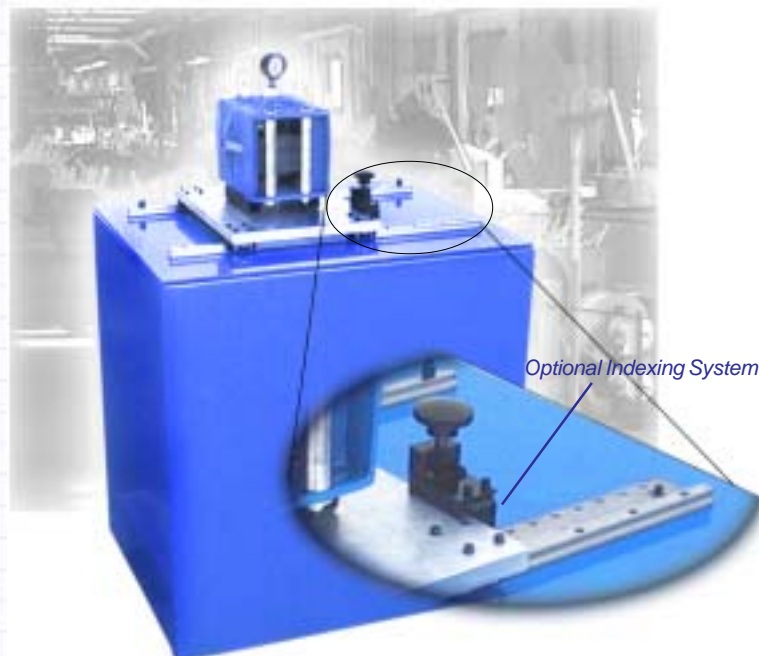
Illustrates Model 4822 4" Wide Tension Device Mounted on 9" traversing slides

This versatile tension and wire guiding system assists the operator in producing AC and DC quality layer wound and field coils under tension at high speeds. By design, it's simple, easy to understand in a few minutes, and easy to operate.