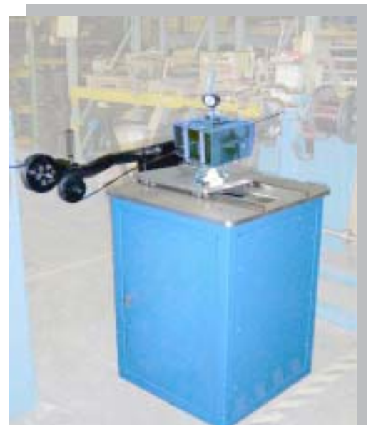
Illustrates Model 4822-00-A-04-09 with optional traversing arm with variable & fixed pitch sheaves for round and formed wire