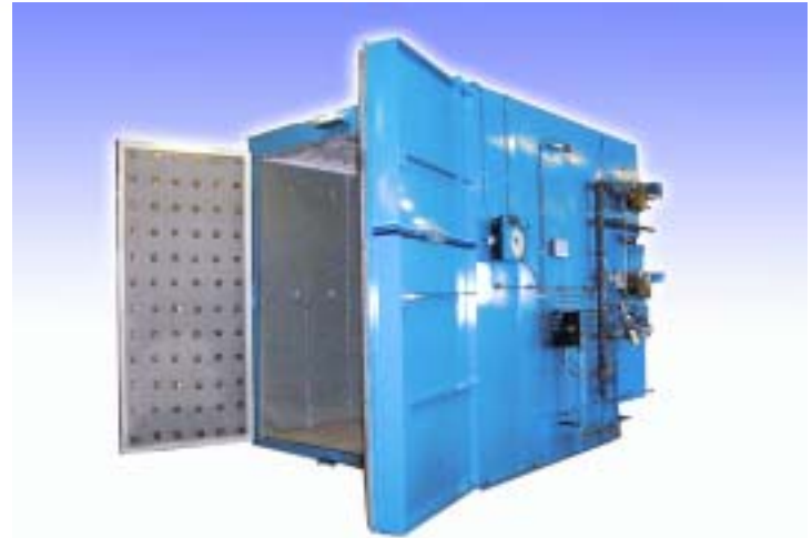
Illustrates Model 3600-RT